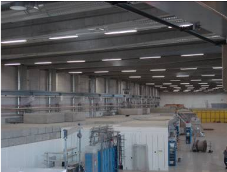
Figure 4 The new built experimental hall on PETRA 3 storage ring for providing 14 beams of brilliant X-ray beams for application ranging from condense matter studies till medicine. On 21 January the first of the 14 undulator magnets that will generate the brilliant X-ray light for PETRA III was installed in the 300-metre-long experimental hall.