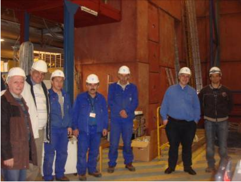
Figure 7 Group of YerPhI technicians and DESY staff in the underground hall of HERA-B experiment on HERA accelerator. For one month YerPhI employees helped DESY in dismantling the experiment already finished. Their work was highly valued by DESY administration. Some electronics parts from abandoned experiment were collected and stored for later transportation to Yerevan. Electronics will be used for preparing classes for Yerevan State University students in new forming Space Education Center of YerPhI.