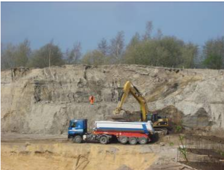
Figure 6 Starting of excavations of the XFEL channel: the entrance at DESY the end of channel will be 3 km further in Schleswig-Holstein. Channel will go 35 meters under surface; construction planned to be finished in 2012 and acceleration sections also should be ready for this time.