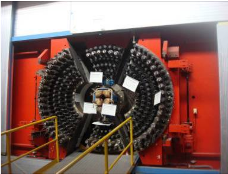
Figure 2 ARGUS spectrometer at the DORIS storage rings; to be changed by OLYMPYS detector from MIT.

On the same way, although on much greater scale are new DESY accelerators. DESY is concentrated now on the production of very powerful beams for different scientific and industrial applications. After closing in 2007 HERA accelerator the high energy physics activity is shifted mostly on the data analysis and participation in LHC experiments. Only one high energy physics experiment with small budget is under consideration now. The Massachusetts Institute of Technology (MIT) propose to use DORIS storage rings to check positron-electron asymmetry in studding scattering on fixed target with OLYMPUS detector. Collaboration spokesman prof. R.Milner and chair of DESY directors board prof H.Dosch invited YerPhI to take part in this experiment planned in 2012.